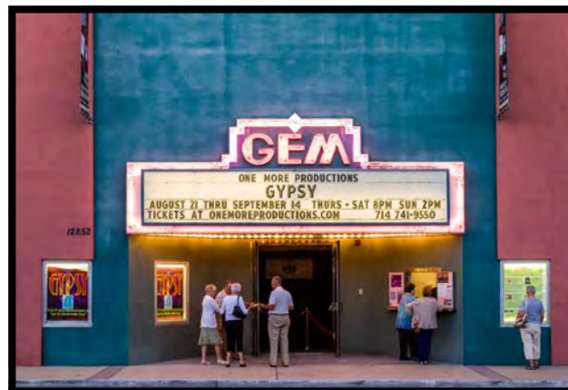
Pam Degarimore, Garden Grove

Here are just a very few samples of the great work on the project, on page 13 also: