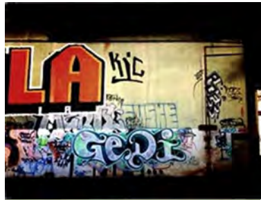
abandoned slaughter house cannery